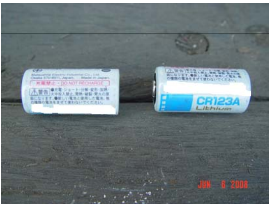
(Primary lithium batteries with unprotected terminals)

Common violations and safety problems noted during these investigations include: