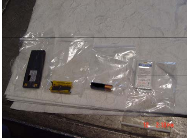
(Individually packaged batteries to prevent short circuits)

All batteries must be packaged for transportation in a manner that prevents short circuiting and damage to the battery or its terminals. This may be achieved by packing each battery in fully enclosed inner packagings made of non conductive material or separating the batteries from each other and other conductive material in the same package and pack to prevent damage and shifting while in transport.