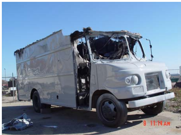
(November 2006 truck fire in Galesburg, IL)

DOT encourages and supports the safe recycling and disposal of used batteries. However, we take an aggressive approach to swiftly investigate and enforce the safety requirements in the HMR for complaints and transportation incidents such as the parcel carrier delivery truck battery incident in November 2006.